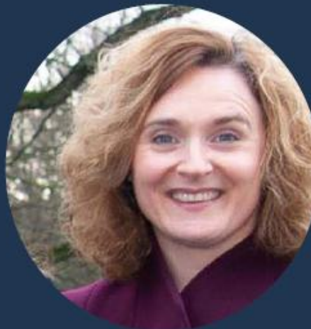
Senior Teacher in charge of Special Educational Needs: