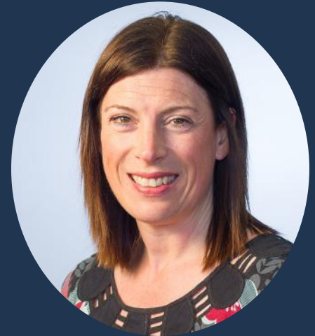
Assistant Pastoral Leader of Year 8: