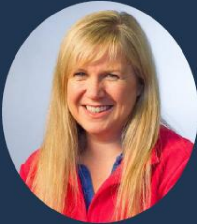
Pastoral Leader of Year 8: Vice Principal in charge of Pastoral Care and Designated Teacher for Safeguarding and Child Protection: